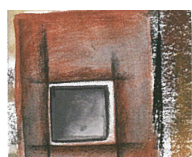
Sanguine Oil working

Sepia Light and Dark lend themselves very well for combining with Pastels and Charcoal. Medium grade. Available in sepia dry light, sepia dry dark, sepia oil light and sepia oil dark.