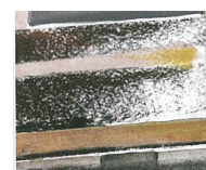
Working with brown chalk